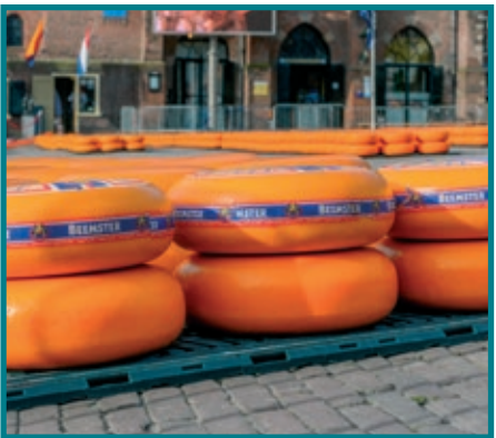
ALKMAR WHERE, FROM APRIL TO SEPTEMBER, WE CAN VISIT ITS TRADITIONAL CHEESE MARKET

IN THE AFTERNOON WE HAVE A SCENIC CITY TOUR WHICH ACQUAINTS US WITH THE CITY'S NARROW CANALS, DAM SQUARE AND ITS HISTORIC CITY CENTRE. AMSTERDAM