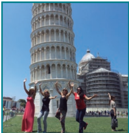
PISA PHOTOGRAPHY : ELISA SCHEGGIA